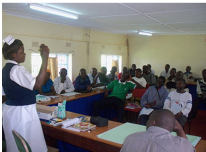
Training of COMACO peer educators in family planning.

In addition to field days, lead farmers sometimes meet with farmers from their producer groups as frequently as once per week because lead farmers