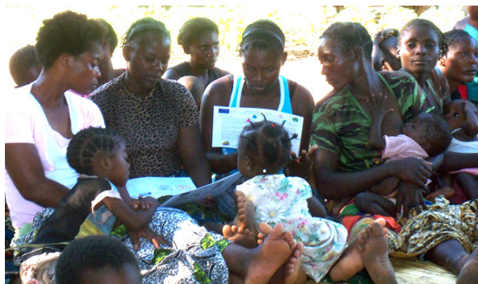
Producer group members using the Better Life Book to learn about the links between conservation, food security, and family planning.