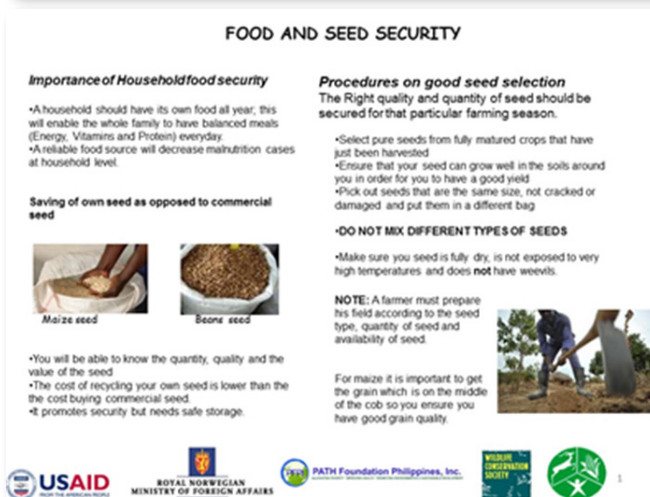
An example of family planning learning pages from COMACO's Better Life Book .