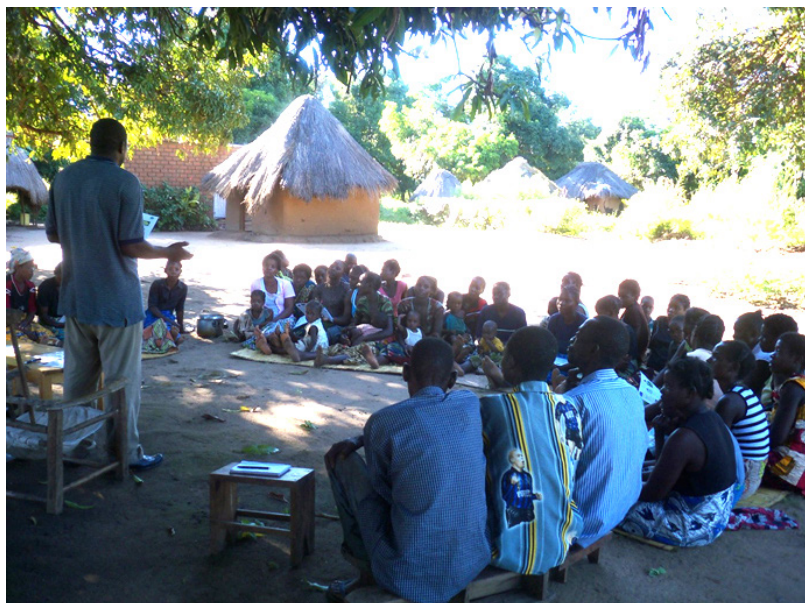
Producer group members gather for a field day led by lead farmers.

The decision to incorporate a population, health, and environment (PHE) approach to the COMACO model in 2010 was prompted by several factors including: growing family sizes that were posing a threat to natural resources and food security; the limited availability of information and methods about family planning in rural Zambia; and the long distances (often up to 12 kilometers) to health clinics. COMACO's Grants Administrator explained, "We realized it was not enough to just preach conservation farming and to provide households with alternative livelihoods skills and distribute [farm] inputs and buy their produce to market it to the shopping outlets. We realized that for the whole cycle to be complete, we needed to combine conservation with family planning. We realized it was important to integrate family planning into the livelihoods structure because only then would the family live a fulfilled life. If they knew how to plan their family size it would be easy for them to have enough labor on their farm plot. It would be easy for them to grow enough food to feed their household. And it would be easy for them to make their own income to take their children to school to provide for medical needs..." The integration of family planning activities was made possible with USAID funds