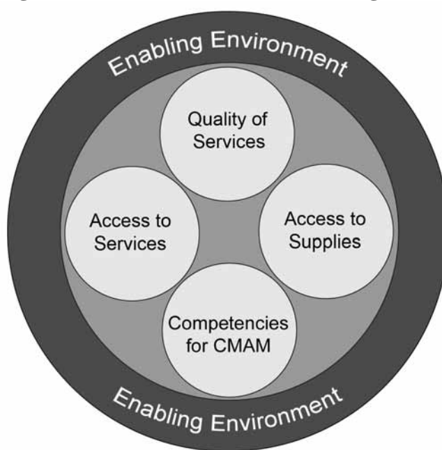
Figure 1. Five Domains of CMAM Integration

A comparison of the experiences among the three countries reveals a number of similarities and differences. Similarities include start-up and scale-up of CMAM services during crises; weak health systems with poor access and low coverage of services; dependence on donor support for supplies; and the presence of numerous stakeholders with fragmented referral and treatment networks. Differences in integration revolve around the extent of Ministry of Health (MOH), UNICEF and international NGO leadership and coordination, and on varying strategies for transferring responsibility for CMAM to MOHs. From this review, key elements for integration of CMAM were identified in five domains: 1) an enabling environment for CMAM; 2) access to CMAM services; 3) access to CMAM supplies; 4) quality of CMAM services; and 5) competencies for CMAM (figure 1.).