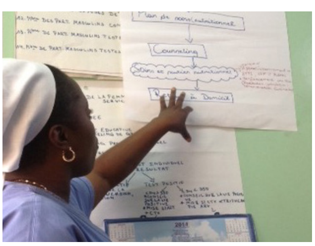
A NACS coach shows a process diagram to help staff at a health facility in Kinshasa identify issues with implementation.

FANTA's training focused on strengthening the competencies of health care workers to address